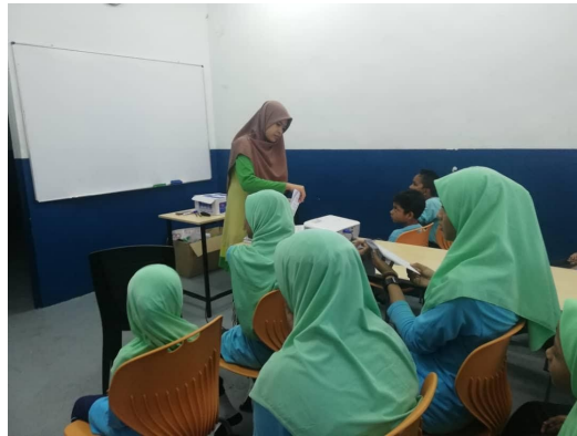
Roll-out session by community educator