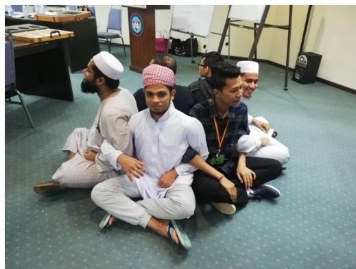
Refresher training at FRHAM